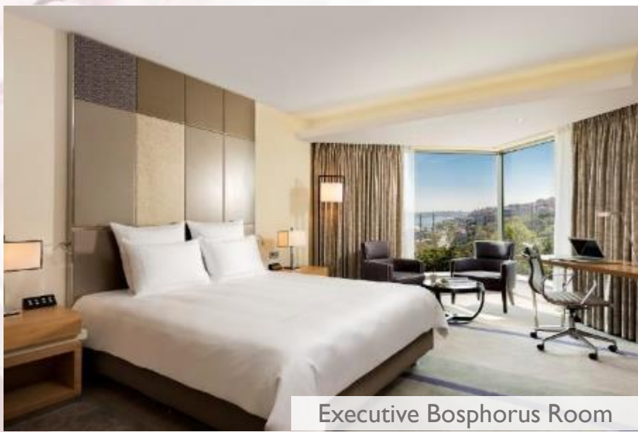
Executive Bosphorus Room